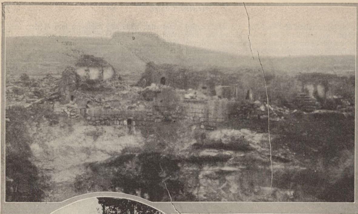
Aintab—after the Turks had sacked it; once a large prosperous Armenian city