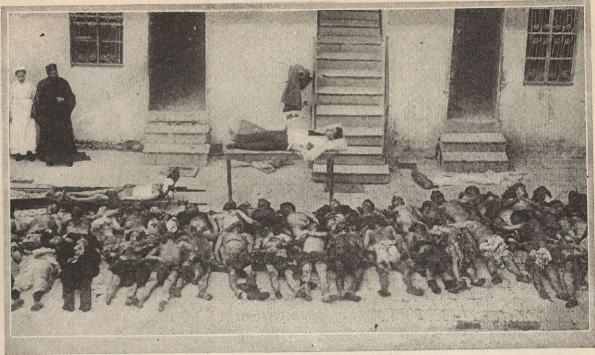
Since the Armistice, the Turks in the remote districts of Asia Minor have continued the slaughter of the Armenian Christians. The massacre of these forty Armenians occurred in February, 1919

withstanding the severest handicaps and a complete lack of Turkish governmental cooperation.