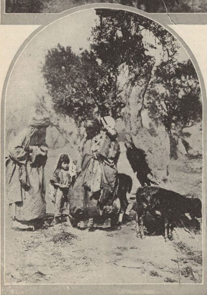
A family of Armenian refugees, with the calves they have saved, arriving at the Mount of Olives

Armistice, the Government abolished all Union and Progress clubs throughout Turkey. But the Ittibat Terraki ringleaders had not decamped without first seeing to it that all records were destroyed and, thus far, in the trials of those officials who stand indicted with massacre or maladministration, the witnesses have revealed but feeble memories. Some fifty or sixty of the Union and Progress gang have been imprisoned, and it is said that the lists of those charged with various offences mount up into hundreds of names. The daily papers are filled with hysterical letters, urging all sorts of immediate, drastic reforms. In short, Turkey is intensely desirous of setting her house in order and of giving that house an immaculate coat of whitewash.