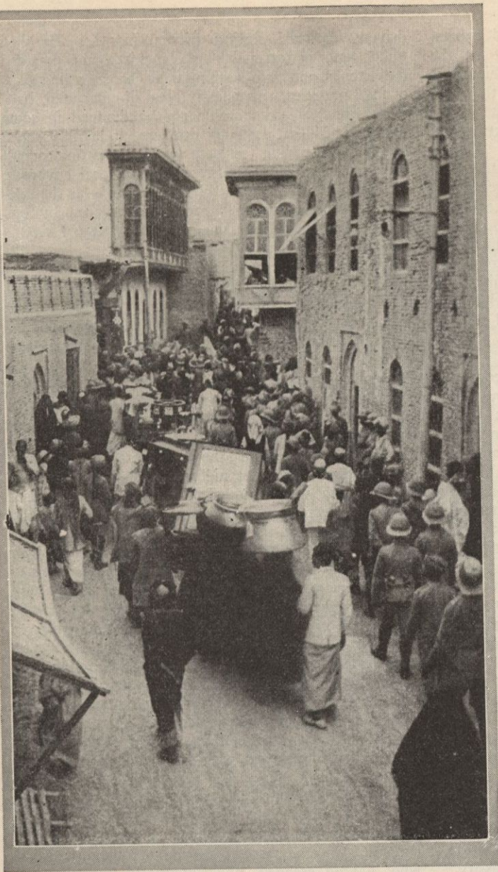
"There goes the bride"—an Armenian wedding procession winding through the streets of Buskra, Mesopotamia