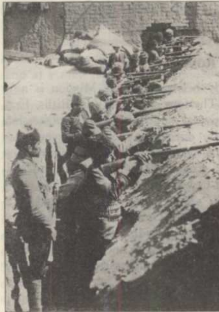
Fighting Men in the Trenches at Van

The relation between these missionaries and the Russian officials has been most cordial and friendly. The Russian government seems to be doing everything in its power for the protection of the great mass of refugees, and in various places has put money into the hands of the missionaries for providing food and also seed for sowing