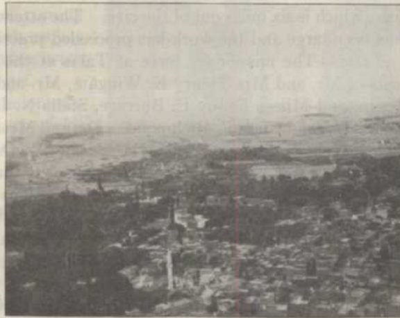
The City of Sivas