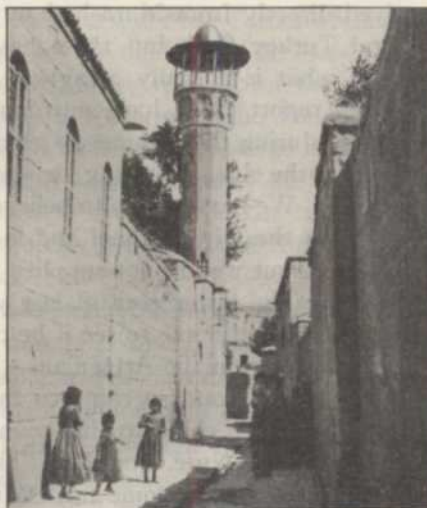
An Aintab Street