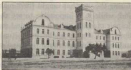
MacLachlan Hall The Main Building of the International College, Smyrna

The college has usually drawn students from regions quite beyond the city of Smyrna, many coming from Greece and from the interior of Asia Minor. Owing to war conditions and the difficulty of transportation and the dangers of the way, during the past year the students have been confined almost wholly to the near vicinity of the college. During the year there has been enrolled in the school, including the sub-freshmen and preparatory classes, 215 students. Of these, 115 are former members of the college, while an even 100 were enrolled this year for the first time; 146 of these were day students coming from Smyrna and vicinity, and 60 were boarders. It is an interesting