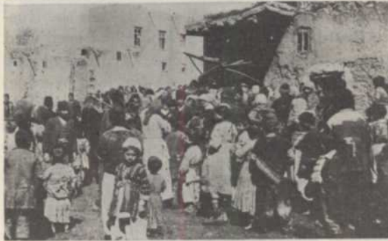
Refugees around the Public Oven, Van.

The American Committee for Armenian and Syrian Relief, organized in October, 1915, has made a very thorough study of the subject, and through its appeal to the American public has raised and used in this relief work some two and one-half million dollars. This endeavor was greatly aided by favorable acts of both Houses of Congress and by a proclamation of the President of the United States designating October 21 and 22 of 1916 as days for special contribution on behalf of the suffering Armenians and Syrians. These funds have been used at six different centers of distribution: namely, Cairo, Egypt, to which place a body of Armenian refugees had escaped; Jerusalem; Beirut, Syria; Constantinople; Tiflis, Russia; and Tabriz, Persia. The Russian and Persian centers of distribution looked after 250,000 Armenian refugees who had fled from