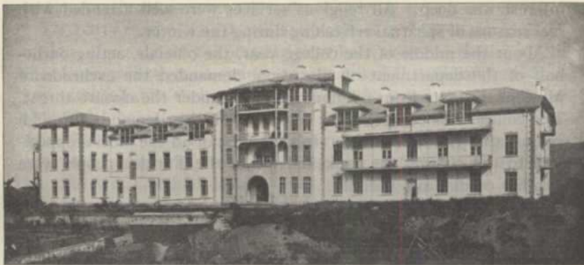
The New Hospital at Marsovan

The King School for the Deaf was undisturbed at the time of the August deportation. The teachers were sent away, but were among those who returned, and in September the work was resumed on practically normal lines until the end of the school year. When finally the Americans were expelled from Marsovan, the authorities solemnly promised that the school would be kept intact as an organization, showing what a deep impression this work for the deaf had made upon the Moslem officials.